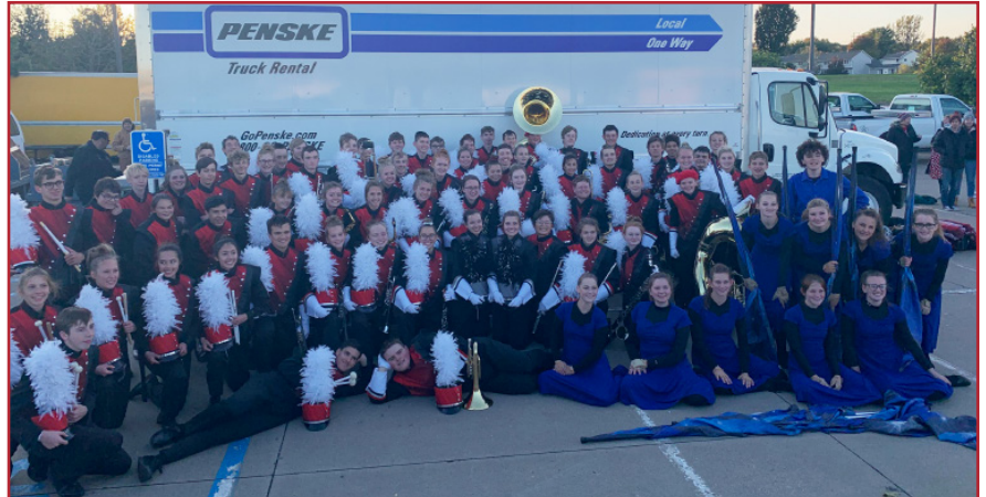
North Polk Marching Comets

The North Polk High School Marching Comets are part of the rapidly growing North Polk school district in Alleman, IA. Students in North Polk High School band department all participate in Symphonic Band, The Marching Comets, and the NPHS Pep Band. They also have the option to play in two jazz bands, participate in solo/ensemble contest, and numerous other musical opportunities throughout the year. The band would like to thank the school board, administration, teachers, parents, and students in the North Polk school district for their support of our program! We would also like to thank all of the hard work of the Urbandale staff, students, and parents at the Urbandale Marching Invitational!