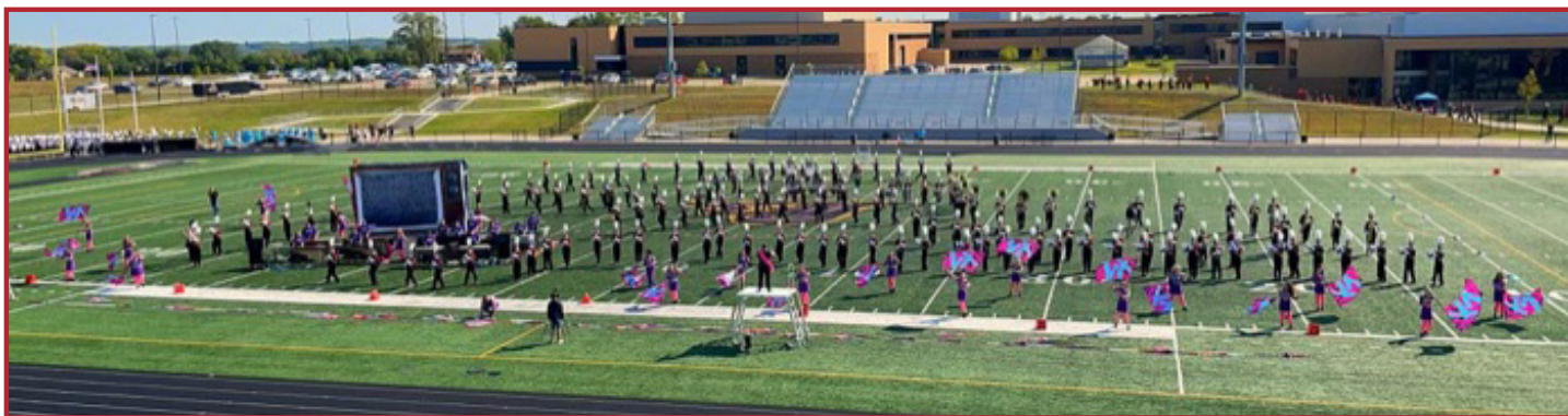
Ankeny Marching Hawks

The AHS instrumental music department offers marching band, three concert bands, four jazz bands, music fundamentals, Honors AP music theory, color guard, winter guard, winter drumline, and numerous solo and small ensemble opportunities.