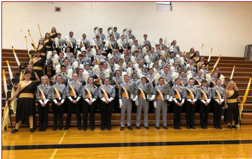
Winterset Marching Huskies

The Winterset High School band program consists of two concert ensembles, two competitive jazz bands, a competitive marching band, a non-competitive pep band, and a musical 'pit' band. Students also get the opportunity to participate in the All-State Music Festival, the SCIBA district honor band, the Raccoon River Conference honor band, various collegiate honor bands, and the IHSMA State Solo and Ensemble Festival. The Winterset Jazz Band regularly appears at the Iowa Jazz Championships, and the Husky Marching Band consistently earns Division I ratings at the state festival and places well at regional competitions. Students involved in multiple ensembles and events will perform almost fifty times throughout a regular school year.