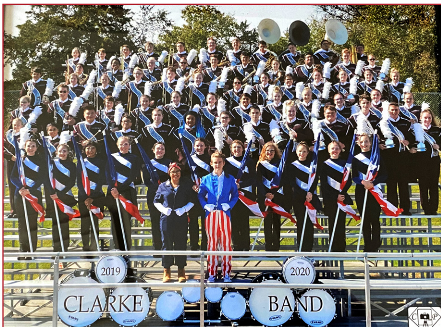
Clarke High School Marching Band