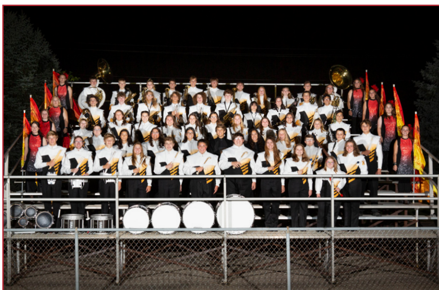
Knoxville Marching Panthers

The Knoxville High School Band program includes marching, concert, jazz, and pep bands. Students in the program also actively participate in honor bands, IHSMA Solo/Ensemble Festival, and chamber ensembles throughout the year. The 2021 Knoxville High School Marching Panthers comprise of approximately 75 high school students. The band performs at all home football games and competes in several central Iowa marching band competitions each year. This year's show is entitled 'Phoenix Rising' and musically embodies the legend of the phoenix from birth, through life, to death, and a rebirth.