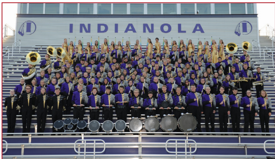
Pride of Indianola Marching Band