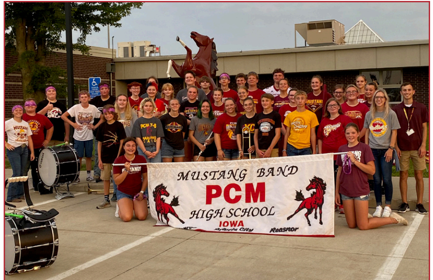
PCM Marching Mustangs

The PCM Marching Mustangs are a staple during the football season and have competed in many competitions in the Des Moines metro area. We are a young band this year, but full of potential and are excited to showcase our marching show!