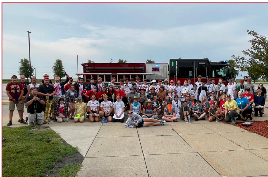
Dallas Center - Grimes Marching Mustangs

It is an honor and a privilege to perform at UMI.