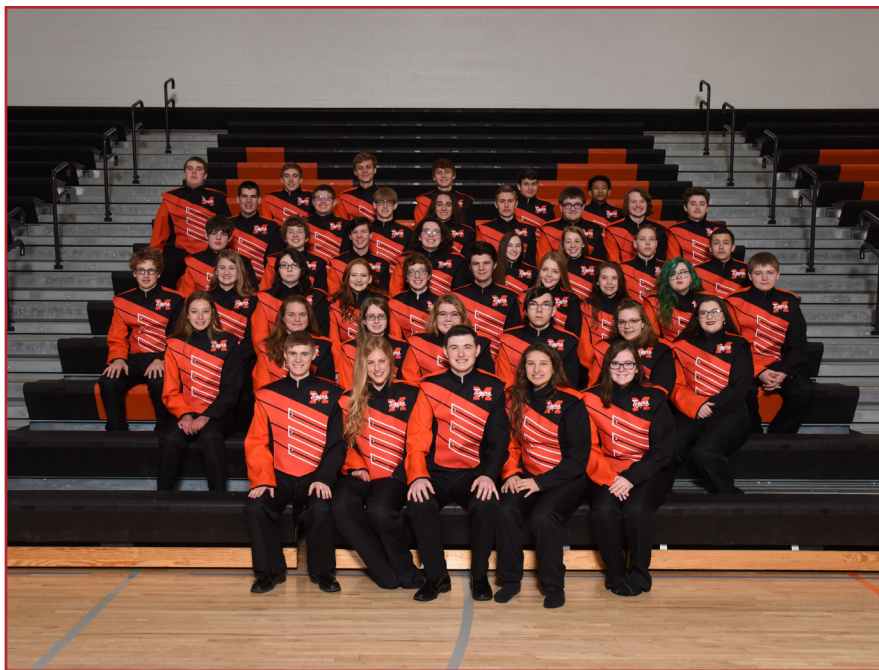
Madrid Tiger Marching Band

The Madrid Tiger Marching Band has participated in the Oktoberfest Parade in Marshalltown for many years earning numerous 1st Place awards in Class 1A and 2A. In 2021 the band earned the first Division 1 rating at the IHSMA State Marching Band Festival in school history. After a several year hiatus, the band is very happy to be returning to the Urbandale Marching Invitational. Thank you to the Urbandale staff, parents, and volunteers for continuing to provide a great opportunity for our student musicians.