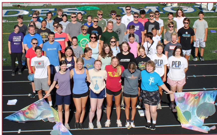
Des Moines Christian Marching Lions