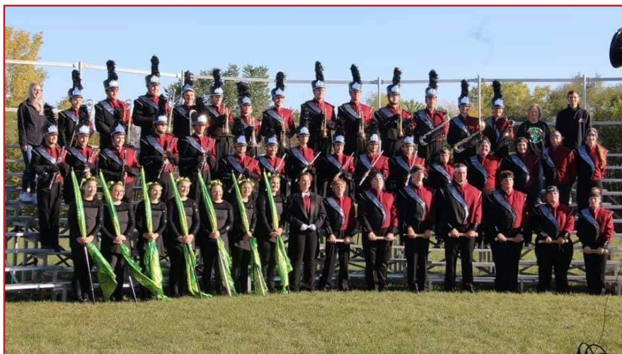
PCM Marching Mustangs

The PCM High School Band program includes marching, concert, jazz, and pep bands. Students in the program also participate in honor bands throughout the year. The 2022 PCM High School Marching Mustangs is comprised of approximately 45 high school students. The band performs at all home football games and competes in several central Iowa marching band competitions each year. This year's show is entitled 'Nevermore' and is inspired by the haunting and irreverent poem "The Raven" by Edgar Allan Poe.