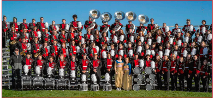
ADM Tiger Marching Band

2022 Tiger marching band is comprised of approximately 95 high school students. This group is once again excited to perform at the Urbandale Marching Invitational.