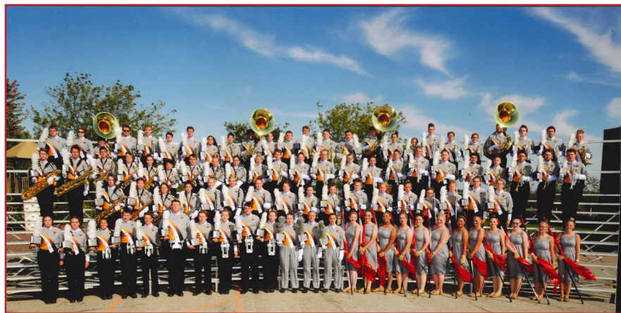
Winterset Husky Marching Band

The Winterset High School band program consists of two concert ensembles, two competitive jazz bands, a competitive marching band, a non-competitive pep band, and a musical 'pit' band. Students also get the opportunity to participate in the All-State Music Festival, the SCIBA district honor band, the Raccoon River Conference honor band, various collegiate honor bands, and the IHSMA State Solo and Ensemble Festival. The Winterset Wind Ensemble has been selected six times as the Iowa Bandmasters Association Class 3A Honor Band with the latest appearance being in 2022. The Winterset Jazz Band regularly appears at the Iowa Jazz Championships, and the Husky Marching Band consistently earns Division I ratings at the state festival and places well at regional competitions. Students involved in multiple ensembles and events will perform almost fifty times throughout a regular school year.