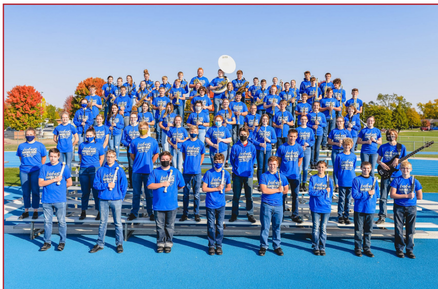
Ogden High School Marching Bulldogs