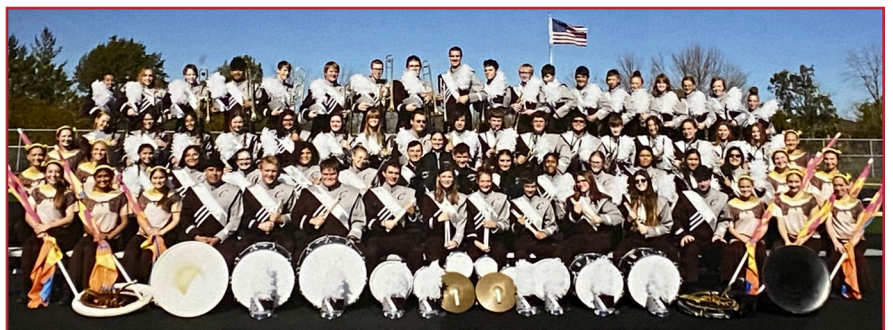
Clarke High School Marching Band