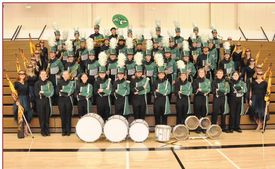
IKM-Manning Marching Wolves

The IKM-Manning Marching Wolves first established competitive marching in 2017. They have since competed in eleven competitions, receiving seven top 3 finishes at those events including three 1st place finishes. They also won six Outstanding Color Guard awards, a Viewer's Choice award at the Missouri Day Marching Band Festival, and two Division I ratings at the IHSMA marching contest. Though the marching program is young, they have doubled in size and achievement in the last five years and look to keep growing.