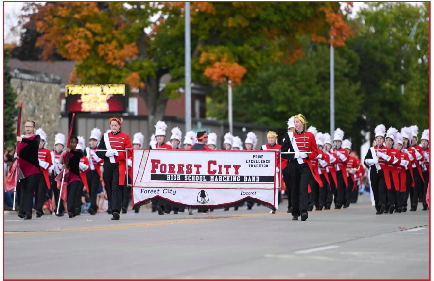
Forest City Marching Band

Forest City High School is excited to be in Urbandale to perform and compete with bands from all over Iowa. The Forest City Marching Band is made up of over 105 students from Forest City, Iowa, and the surrounding areas. Students also participate in concert band, solo and ensemble, and pep band throughout the year, as well as several non band activities. Forest City would like to thank the administration, all faculty, staff, and parents for their incredible support to help the band year in and year out. Thank you to the administration and band staff at Urbandale for allowing us to make the trip to compete here!