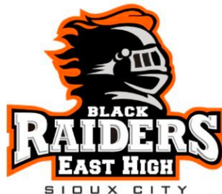
Black Raider Marching Band

The East High School Band program offers a comprehensive music education experience that includes 2 sections of Concert Band, the Symphonic Band, 2 Jazz Bands, Pep Band, and the Black Raider Marching Band.