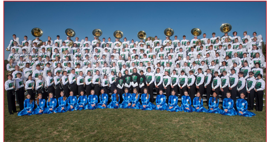
The Marching Dutch

The band has appeared in many nationally recognized festivals and parades every three or four years since 1978, including the Cherry Blossom Parade, The Outback Bowl Parade, The Festival of States, The Citrus Bowl Parade and the Pasadena Tournament of Roses Parade. On January 2, 2023 the Marching Dutch will make their third appearance in the Pasadena Tournament of Roses Parade!