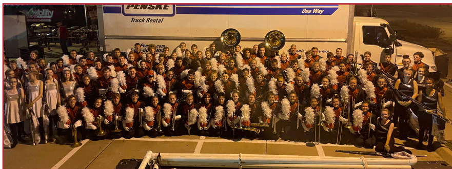
North Polk Marching Band

Elsa's Procession to the Cathedral Another Day of Sun Marriage of Figaro A Dream Is a Wish Your Heart Makes I Will Always Love You When I'm 64 Come Sweet Death Prelude in E Minor